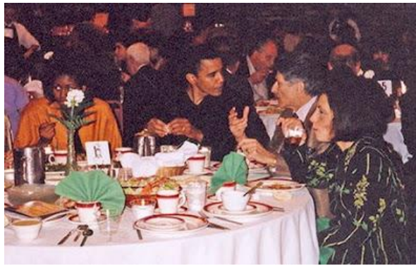
The Obamas and the Sais dining together in Chicago (1998)